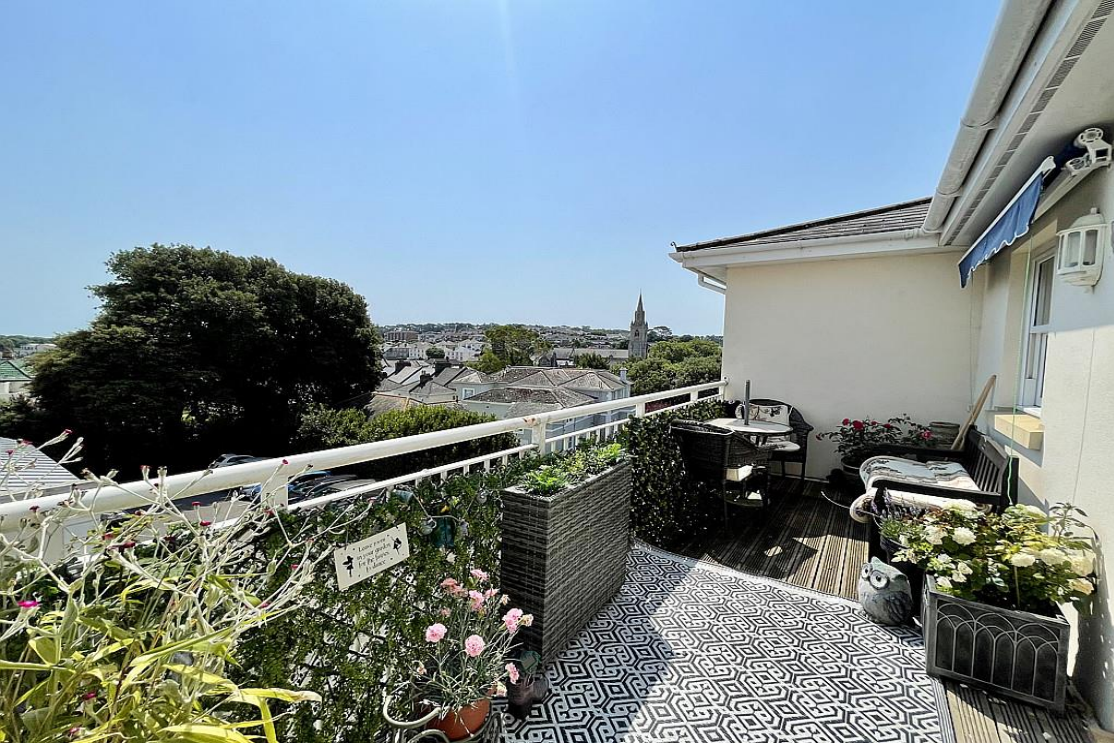
Our View "A delightful apartment with parking and private balcony"