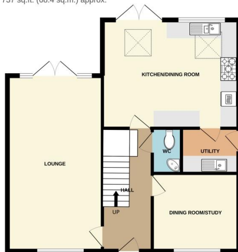
GROUND FLOOR 737 sq.ft. (68.4 sq.m.) approx.