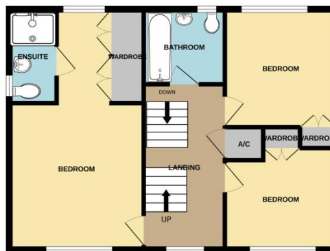
1ST FLOOR 602 sq.ft. (55.9 sq.m.) approx.