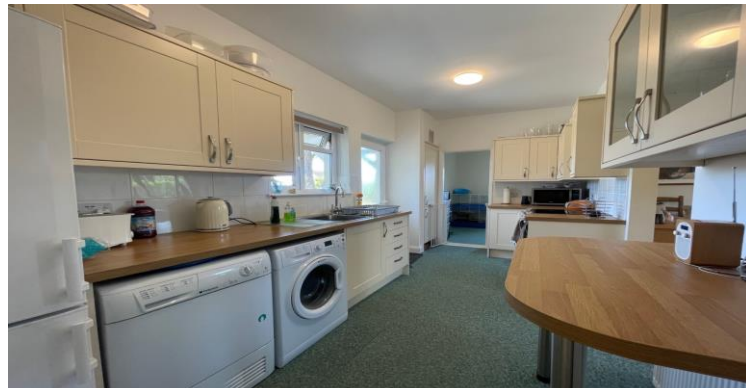
Our View "Well presented three bedroom property with level surrounding gardens in popular residential location."

A superb three bedroom detached property positioned on a corner plot with driveway, garage and private gardens.