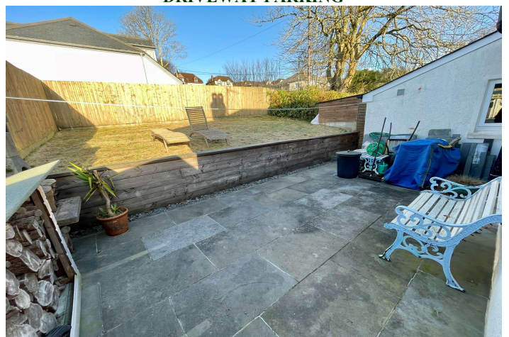
REAR GARDEN AND PATIO